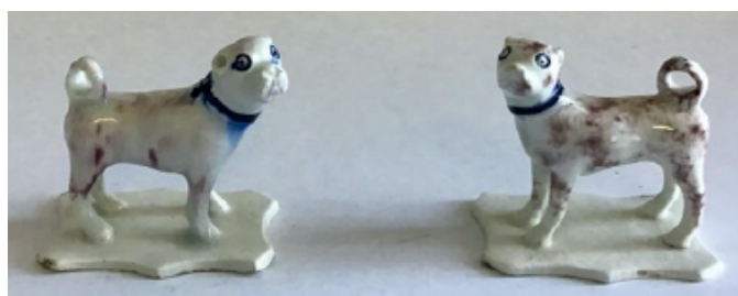
A rare pair of Lowestoft Porcelain pugs, c.1770